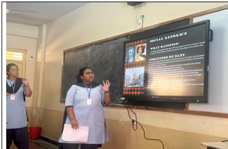
Presentation on Raja Ram Mohan Roy