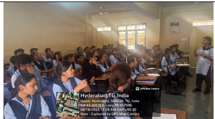
Students enthusiastically listening to the explanation