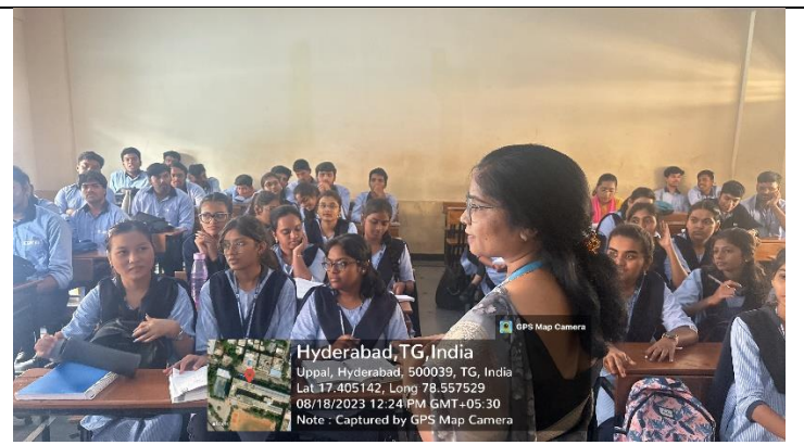
Students are being debriefed on the topics covered.