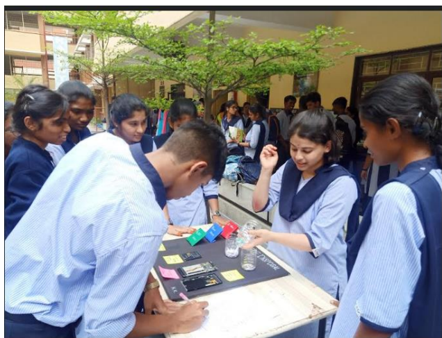
Students listened to the explanation and writing the feedback on model presentation.