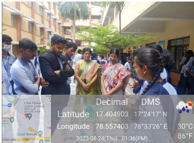
Students and staff seeing the models displayed by participants.

Students, in their feedback, shared that viewing these presentations helped them realize the importance of reducing waste and various ways of its disposal.