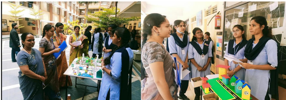
Judges, staff and students listening to presentations by participants