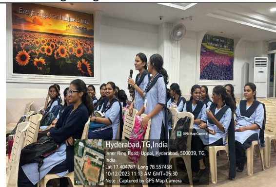
Question and Answer Session