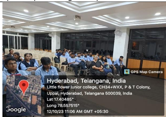
Students listening to the programme