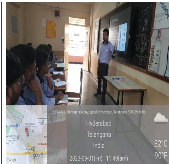
PPT presentation on parasitic disease Malaria

The overall outcome of the session was that the students learned about the importance of healthy lifestyle, the preventive and presumptive treatments for various parasitic diseases, their diagnostic techniques for their identification and also how to control and protect themselves from the infections or infestations.