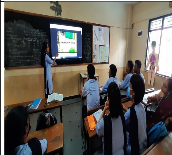
Presentation on Chikunguniya virus