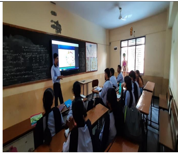
Student presenting on host parasitic interaction