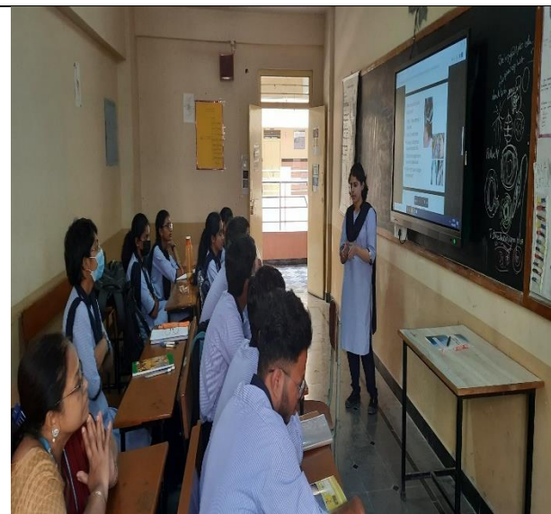
Presentation on Leishmaniasis