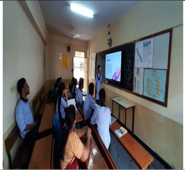
Presentation on Zoonotic diseases