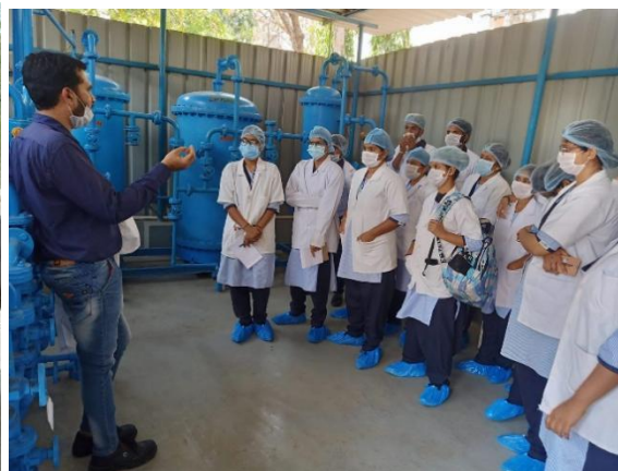
Students and staff group photo in Elegant Chemicals Industry PVT LTD Industry visit