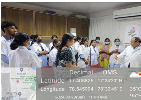
Students visiting various Units in Elegant Chemicals Industry PVT LTD Industry