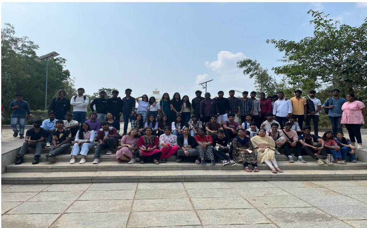
Students at the entrance of Buddhavanam

The trip included visits to key landmarks such as Buddhavanam and the Power House, where students gained insights into the rich cultural heritage of the region and witnessed the marvels of modern engineering. The lunch was organised at VIJAYA VIHAR – Amaravathi Family Restaurant, Nagarjuna Sagar. Additionally, the tour of the dam waters provided students with a unique and enjoyable experience, facilitating interpersonal connections.