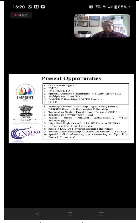
explaining about various sources where research grants can be obtained