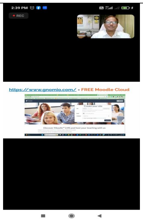
Speaker explaining about various free 'open online courses'