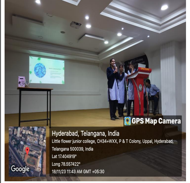
Student presenting their idea – Enchanted, an online platform for gifting flowers