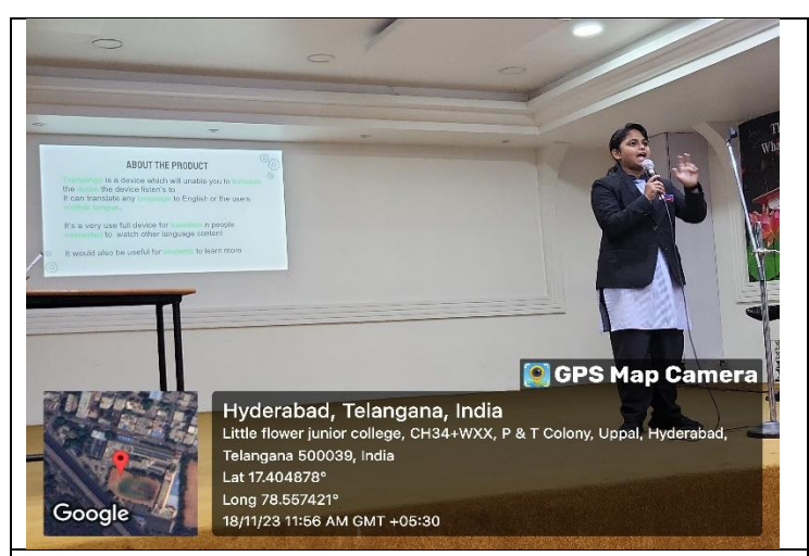
Student giving presentation on her AI App, Translingo