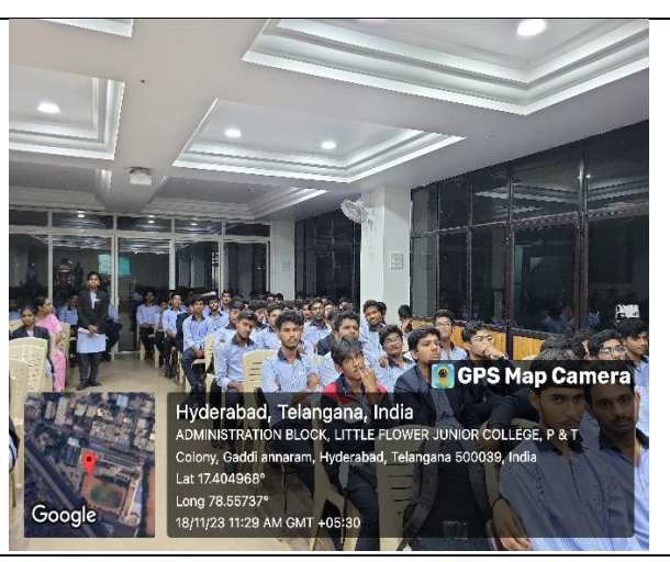
Students attending the event