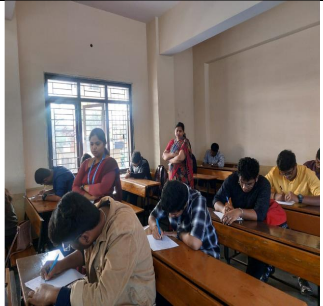
Faculties in charge, supervising the participants