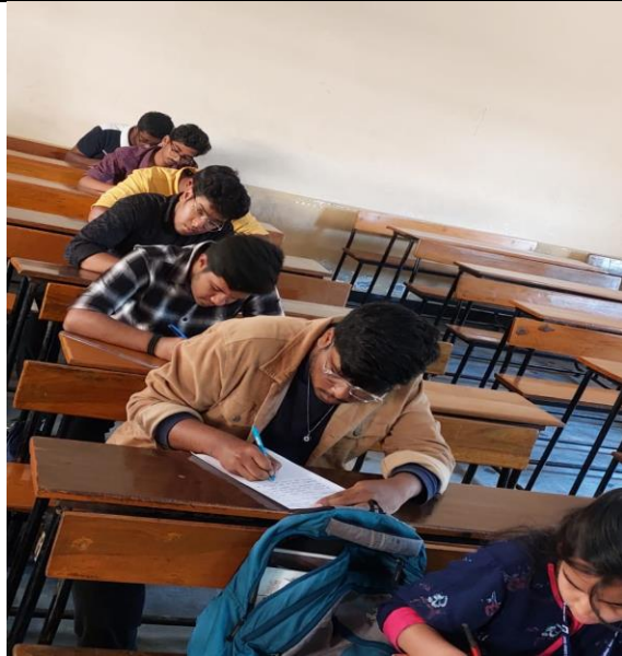
Students from different colleges, participating in the competition

The National Education Policy, 2020 (NEP) envisions a significant transformation in education, emphasizing the core values and principles that education should instill in students. As part of the intercollegiate competitions, the Commerce and Management department hosted a competition called "Write-Up" on the New Education Policy on February 1, 2024, from 11:30 a.m. to 12:00 p.m. in room D01. The main aim of conducting this activity was to help students learn about the National Education Policy (NEP) and enhance their writing skills. Students from LFDC and other colleges, representing various streams, showed keen interest in the topic. They actively participated and demonstrated their presentation skills by writing a report on the National Education Policy (NEP). Through their write-up, they shared their views and opinions about the New Education Policy.