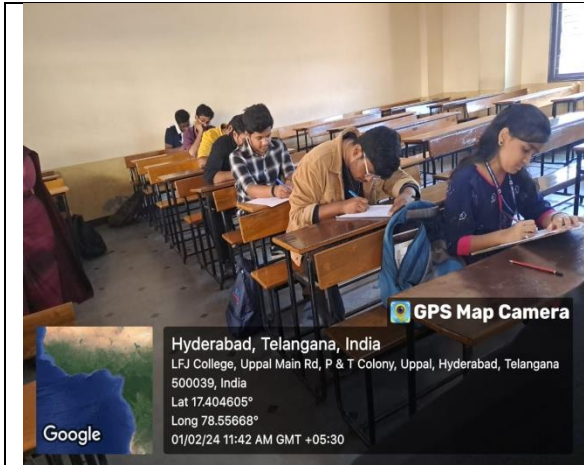
Participants writing the write-up