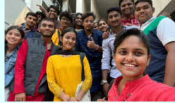
LFDC has won 1st prize in Bhadruka's College for Rangmanch Drama