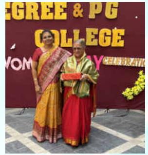
Women's day celebrations