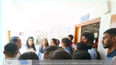
FIELD TRIP TO NATIONAL INSTITUTE FOR THE EMPOWERMENT OF PERSONS WITH INTELLECTUAL DISABILITY BY DEPARTMENT OF PSYCHOLOGY