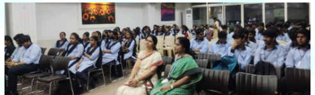
HAPPY HORIZONS SYMPOSIUM ON INTERNATIONAL DAY OF HAPPINESS