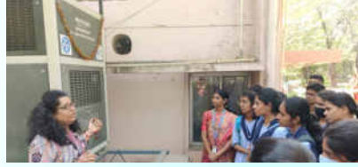
FIELD TRIP TO IICT BY THE DEPARTMENT OF CHEMISTRY