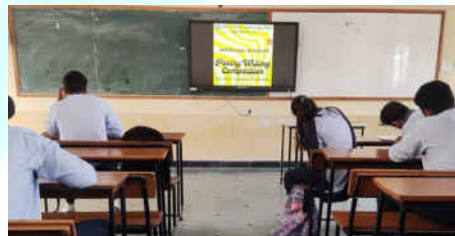
POETRY WRITING COMPETITION ON WORLD POETRY DAY BY THE DEPARTMENT OF ENGLISH