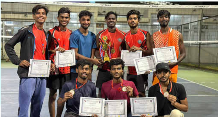
LFDC has won 1st prize in volleyball at Symbiosis college