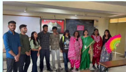
WORLD THEATRE DAY BY THE DEPARTMENT OF MODERN LANGUAGE