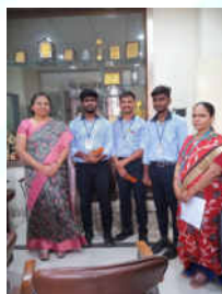
WORLD WATER DAY BY THE DEPARTMENT OF BOTANY