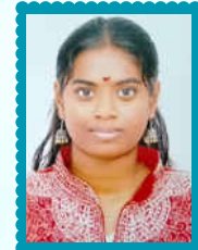
VAISHNAVI B.COM HONS-2