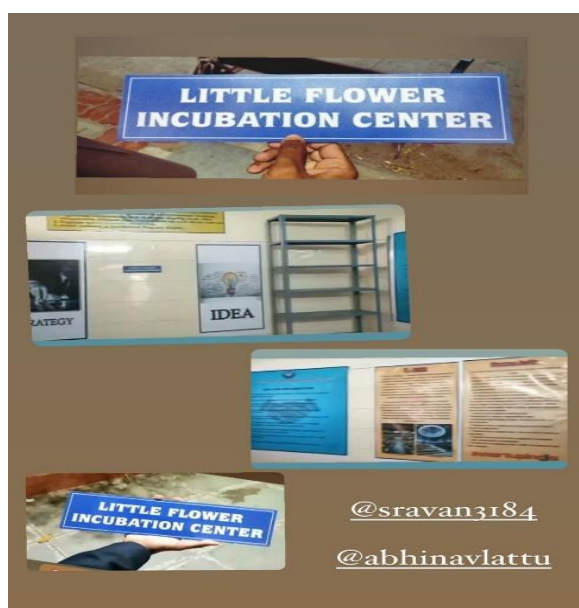
Collage of the picture of incubation