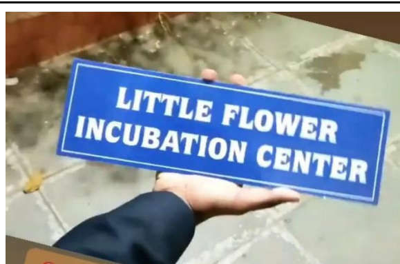
Name plate of incubation centre