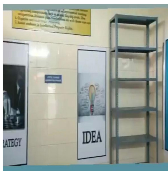
Picture of incubation centre