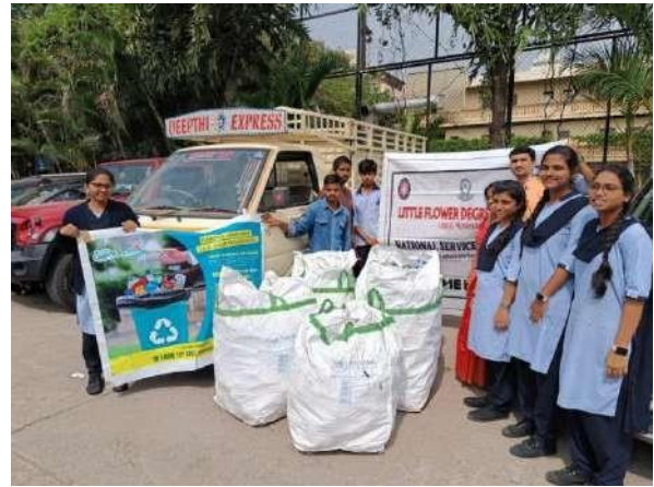
Students in collaborations with NGO Bottles for change