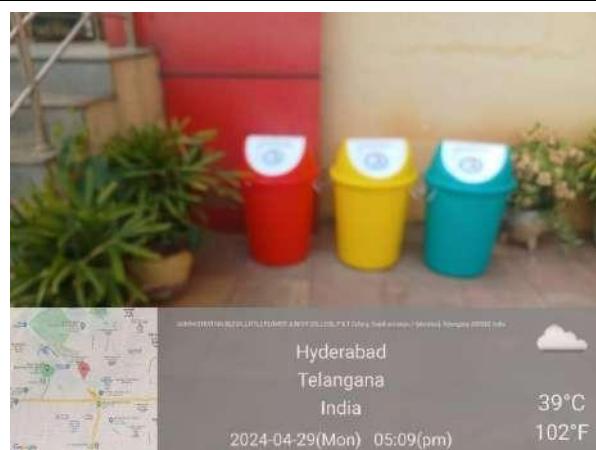
Trash placed in the campus