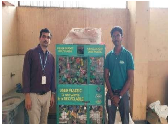
Collection of plastic waste

Mobile : 7673960152 E-mail : littleflowercollege@gmail.com Website : www.lfdc.edu.in