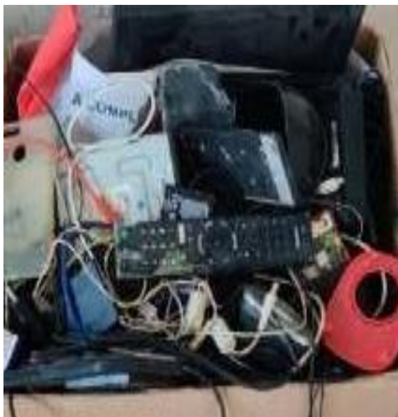
Collection of E-waste