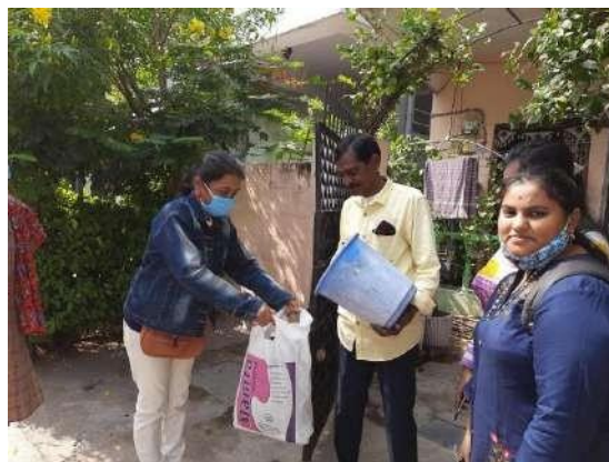
Students collecting vegetable waste for compost

Jayanthi PRINCIPAL Little Flower Degree College Uppal, Medchal Dist-500039. College Code : 2010