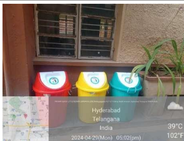
Disposable old solid, food and paper