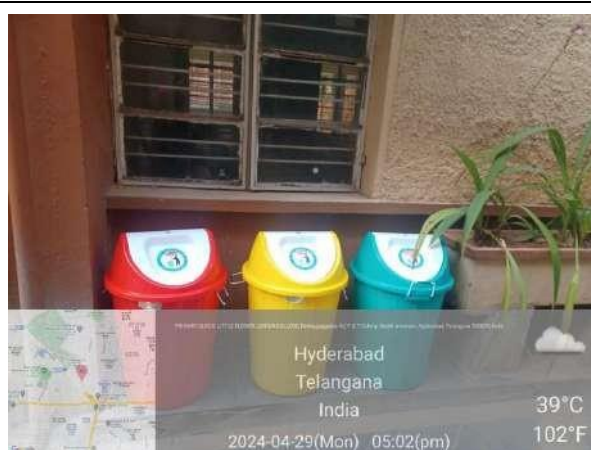
Trash placed in the campus

Jayanthi PRINCIPAL Little Flower Degree College Uppal, Medchal Dist-500039. College Code : 2010