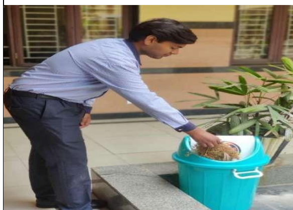
Student using trash bin for dry waste