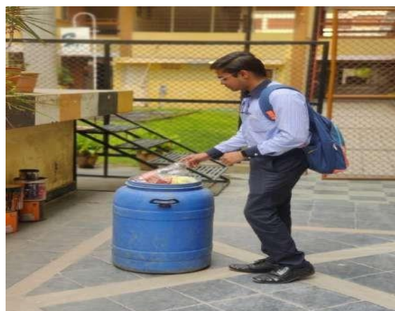
Student using trash bin for solid waste