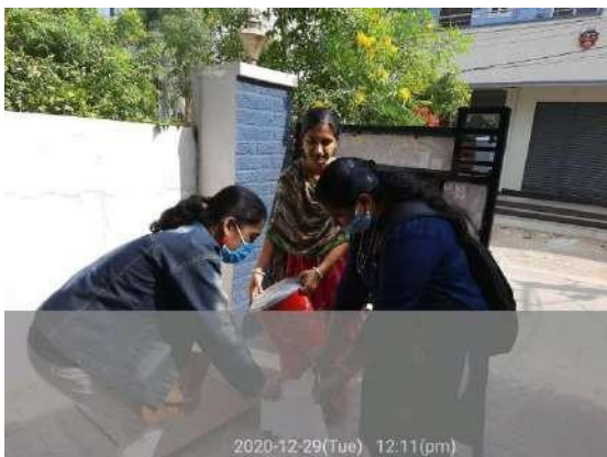
Students collecting vegetable waste for compost