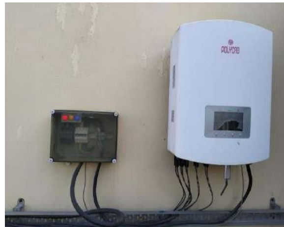
Meter of Solar panel