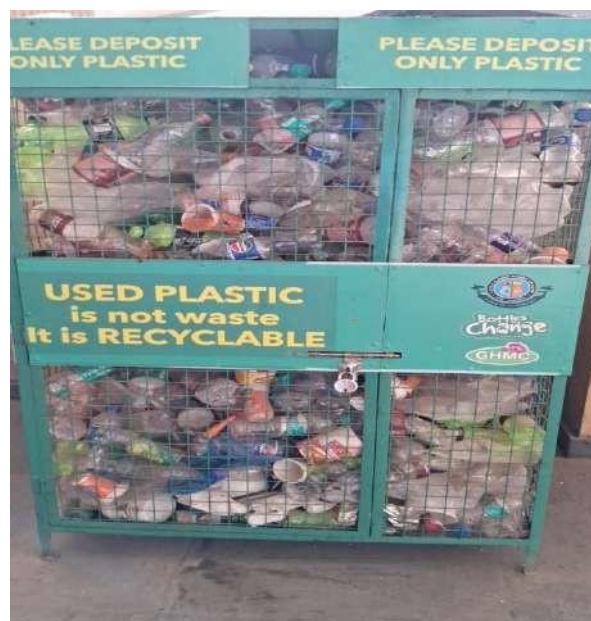
Collection of plastic bottles for recyclable