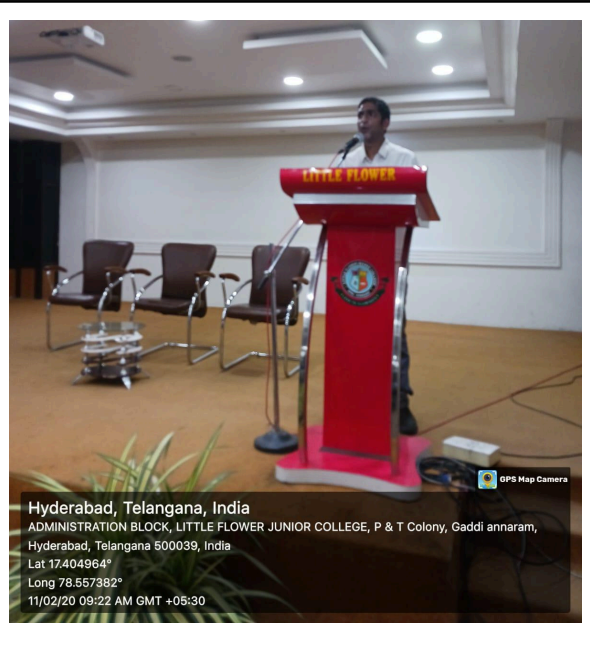
Hyderabad, Telangana, India ADMINISTRATION BLOCK, LITTLE FLOWER JUNIOR COLLEGE, P & T Colony, Gaddi annaram, Hyderabad, Telangana 500039, India Lat 17.404964° Long 78.557382° 11/02/20 09:22 AM GMT +05:30