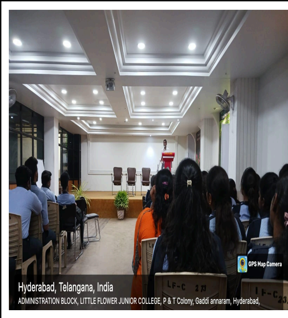
Hyderabad, Telangana, India ADMINISTRATION BLOCK, LITTLE FLOWER JUNIOR COLLEGE, P & T Colony, Gaddi annaram, Hyderabad,