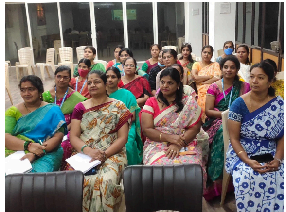
Faculty listening attentively to the speaker